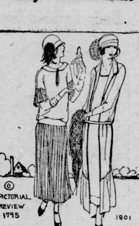
JUST AS PARIS DECREES

Artful and new are the frocks pictured here, the fashionable wood brown shades of heavy silk crepe de Chine having been selected for their development. The first model pictures the circular flounce at the bottom of the plaited apron front so greatly affected by well-dressed Parisiennes. The long, waisted blouse falls gracefully over a belt of self-material to which the plaited apron is attached. A sectional collar finishes the round neck, while the short sleeves are trimmed with plaited frills of self-material. Medium size requires 6 1/2 yards 36-inch material. Becoming alike to slender and stout figures is the second model, with a deep circular flounce at the bottom of the skirt. It is trimmed with fancy silk braid stitched on to emphasize the coat effect of the front of the dress. Surmounting the revers is a collar of self-material. A narrow belt holds in the fulness at the waist. Medium size requires 6 1/2 yards 36-inch material. First Model: Pictorial Review Dress No. 1795. Sizes, 34 to 48 inches bust. Price, 45 cents. Second Model: Dress No. 1801. Sizes, 34 to 52 inches bust. Price, 45 cents.