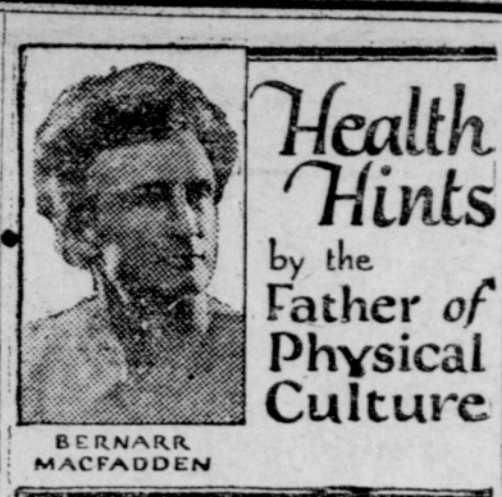
Health Hints by the Father of Physical Culture

It is hardly necessary to mention the necessity for breathing pure air, and especially when taking deep-breathing exercises, if you wish the very greatest results. Take these deep breaths when in the open air, or else before an open window. It is a good plan, for instance, when rising in the morning to stand before an open window and inhale perhaps a dozen full, complete breaths. This will help greatly to brush cobwebs from your brain and brighten you up for the day's duties and responsibilities.