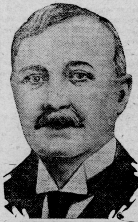
Senator W.C. Bruce

There is one man of whom it can be said that he, more than any other, is responsible for the general and widespread antipathy in Maryland to the prohibition amendment that man is Senator Bruce.