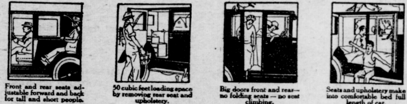
Front and rear seats adjustable forward and back for tall and short people. 50 cubic feet loading space by removing rear seat and upholstery. Big doors front and rear—no folding seats—no seat climbing. Seats and upholstery make into comfortable bed full length of car.

Plan now to come in! Learn all about this first real all-purpose closed car! Get acquainted with its unique benefits for the salesman, the merchant, the farmer and the family! Free demonstration! No charge! No obligation! Come in!