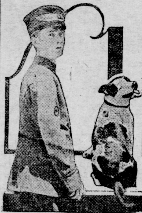
WESLEY BARRY in 'HEROES OF THE STREET' A WARNER BROS. PICTURE THE THEATRE BEAUTIFUL Tuesday—Wednesday

TONSILLITIS Apply thickly over throat—cover with hot flannel—VICKS VAPORUB Over 17 Million Jars Used Yearly