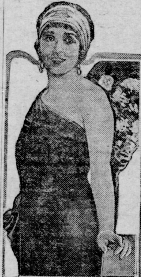
Florence Vidor in 'MAIN STREET' A Warner Bros. Production.

Senator Johnson says in his announcement of the presidential nomination that he desires a definite foreign policy. So do we all, Hiram, and the quicker the better. Johnson has been five years in coming to his conclusion.