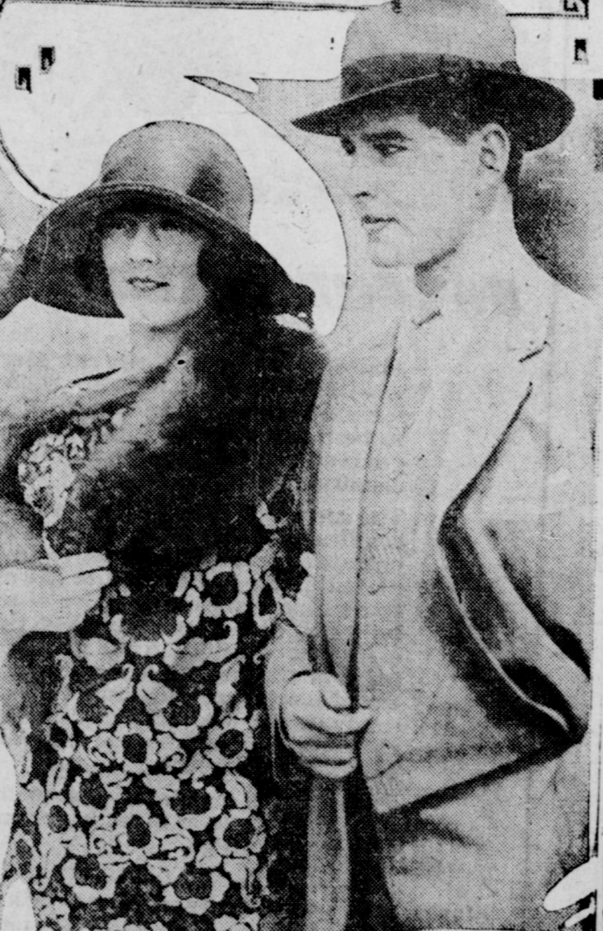
Mr. and Mrs. Cornelius V. Whitney.