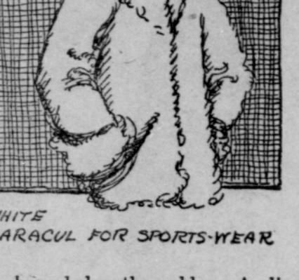
CARACUL FOR SPORTS-WEAR