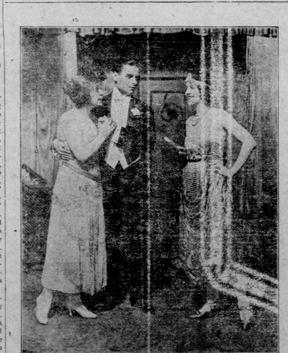
Scene from "The Gold Diggers" Coming to the Vining Friday

Table No. 2 was soft and comfy, but it was a little tough being thumped all over to see if anything