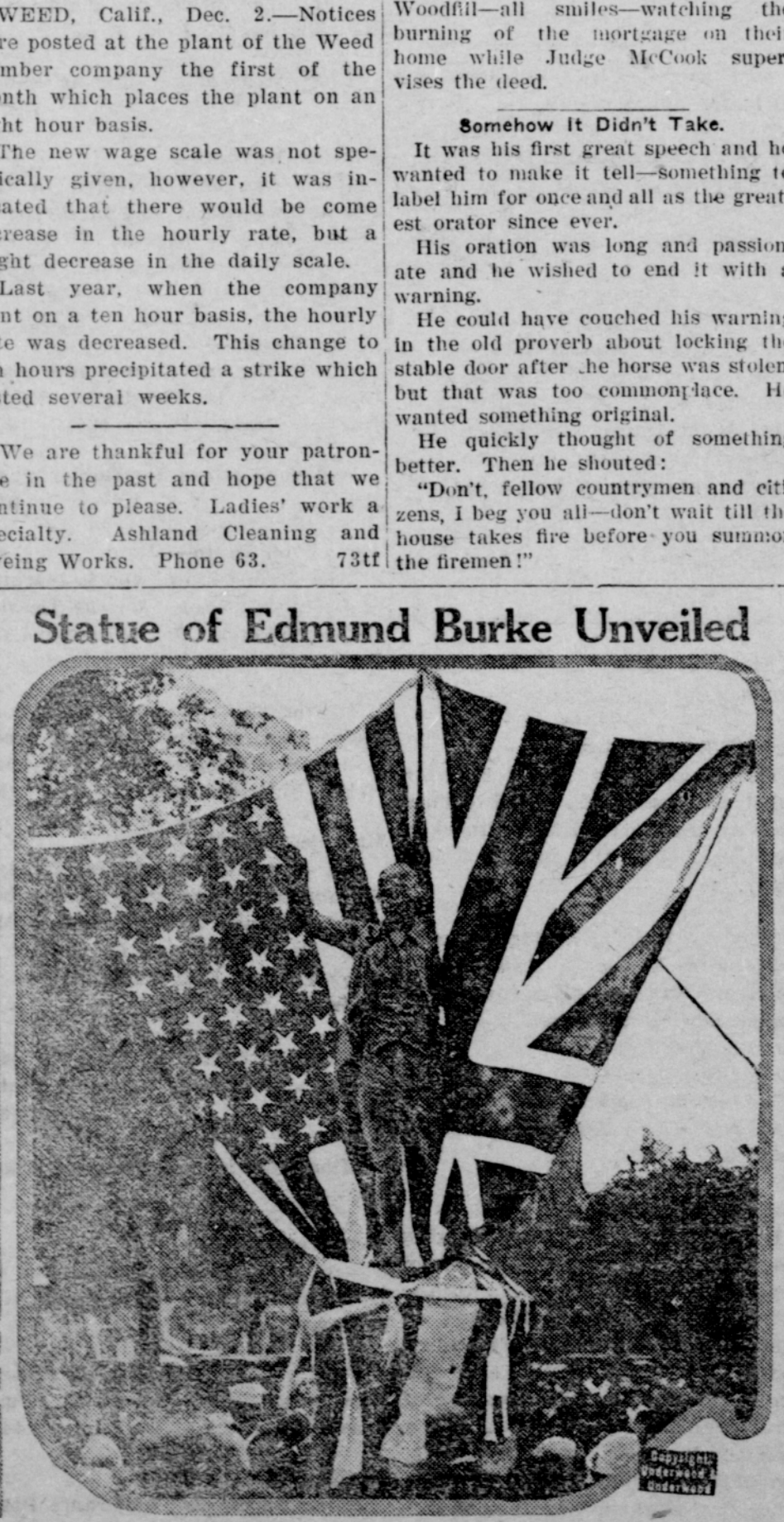
In furthering the policy of fostering friendship between English-speaking peoples, Sir Charles Wakefield, former lord mayor of London, in behalf of the Sulgrave Institute of Great Britain, presented to the United States a statue of Edmund Burke, the famous British statesman who held out for a conciliatory attitude toward the American colonies. Secretary of War Weeks accepted the statue on behalf of the United States. The photograph shows the unveiling in Washington.