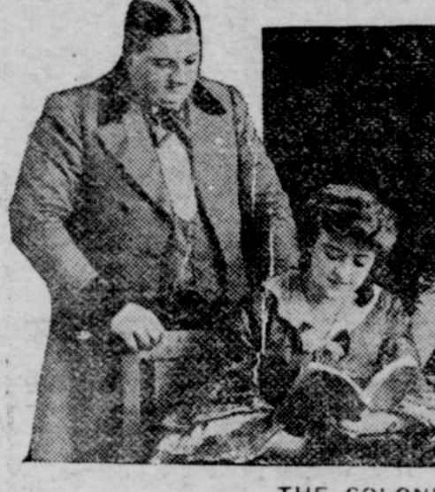
THE COLONIAL PLAYERS

With a clever thread of plot running through their entire concert and dramatic program, the Colonial Players, who are to appear on the local lyceum course this season, promise something different in lecture course entertainment.