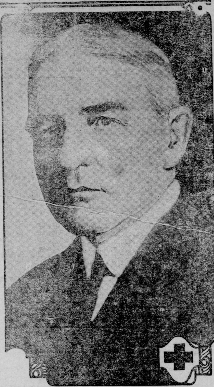
John Barton Payne, who was Secretary of the Interior in President Wilson's Cabinet, Chairman of the American Red Cross, which will hold its Annual Roll Call from Armistice Day, Nov. 11, to Thanksgiving, Nov. 30. More than 4,000,000 members enrolled during the Roll Call last year and the 3,300 active Red Cross Chapters at home and abroad will strive to maintain this membership strength for the work of the organization during the coming year.

Heard Here and There. "Opportunity," divulged the henpeck, "knocks but once, proving it is not of the feminine sex." "Might," explained the big man gently to the little man whom he was pommeling rather ungently, "isn't right, but it helps a whole lot." "Religion," cried the atheist, "is a lazy explanation of mystery." "Things left unsaid," wept the unsuccessful flirter whose object of flirtation refused to respond with even a single syllable, "often hurt more than things spoken." "Bah, bah!" answered the baby when asked his opinion of a piece of free verse just read him.