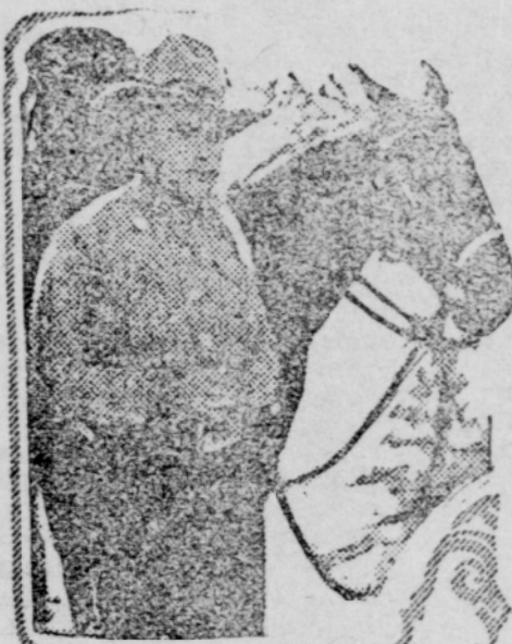
"THE SAGE BRUSH TRAIL" Vining Theatre, Tomorrow, Saturday

Another would secretly fasten the end of a roll of sinew to a twig, swallow the ball and hold the twig between his teeth. After the sinew had softened and expanded "because of the heat and moisture of the stomach" the magician would astound his friends.—Adventure Magazine.