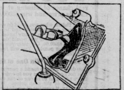
Steady Foot Control.

Rough road driving causes the foot to bob up and down on the accelerator.