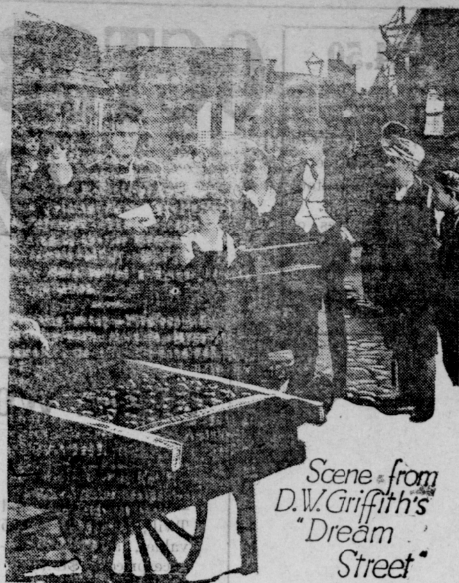
Scene from D.W. Griffith's "Dream Street"

Many motorists completely wear out the front tires on their cars before they find that the wheels do not run parallel. In the ordinary car front wheels are toed in 3-16 to 3-8 of an inch to take care of their spread under power. In the opinion of tire men failure to properly align the wheels is responsible for the premature scrapping of tens of thousands of tires. Wheels of new cars require less toeing in than the wheels of cars already lumbered up.