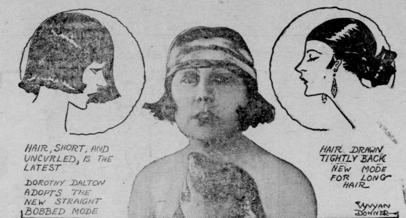
HAIR, SHORT, AND UNCURL, IS THE LATEST DOROTHY DALTON ADOPTS THE NEW STRAIGHT BOBBED MODE HAIR DRAWN TIGHTLY BACK NEW MODE FOR LONG HAIR

THERE has been much wailing and gnashing of teeth among the bobbed heads of the land. And much too much flourishing and waving of the curling irons. And burnt-up hair, and coarsened locks, dried by the permanent-rinsing of the hair. One had to have short, curly hair—because everybody had to have short, curly hair. And the funny part was, no one ever had short hair and curly hair together at the same time and the right 'inc. The coiffure was full and fluffy and round when one had no time to go, and when one had some place to go, with a beau, one's hair looked like Sam Hill. Fresh curls, the weekly shampoo, and the Special Date never seemed to synchronize. Life was becoming too complicated. Something had to be done to save the heads of the fair. They couldn't get along with bobbed hair, and they wouldn't give it up.