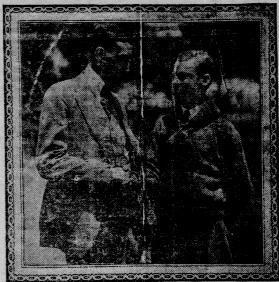
Motion Picture Producers Are Not so Much Interested in the Millions of Dollars Invested in the Industry, as They Are in Morals and Education of Children, Says Hays.

In an eloquent and forceful appeal to the public to have faith in motion pictures, Will Hays, head of the Motion Picture Producers' and Distributors' Association, as the guest of the Los Angeles Chamber of Commerce at their weekly luncheon at the Alexandria Hotel, said that the evils, if any, now existing in Hollywood shall be eliminated. He declared that the one bad influence in the film colony is talk.