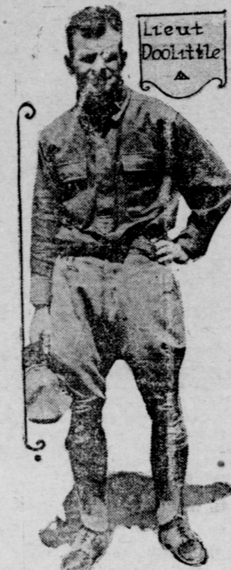
against Germany. He did not serve overseas, however.

A native of California, Lieutenant Doolittle has been in the aviation service since war was declared