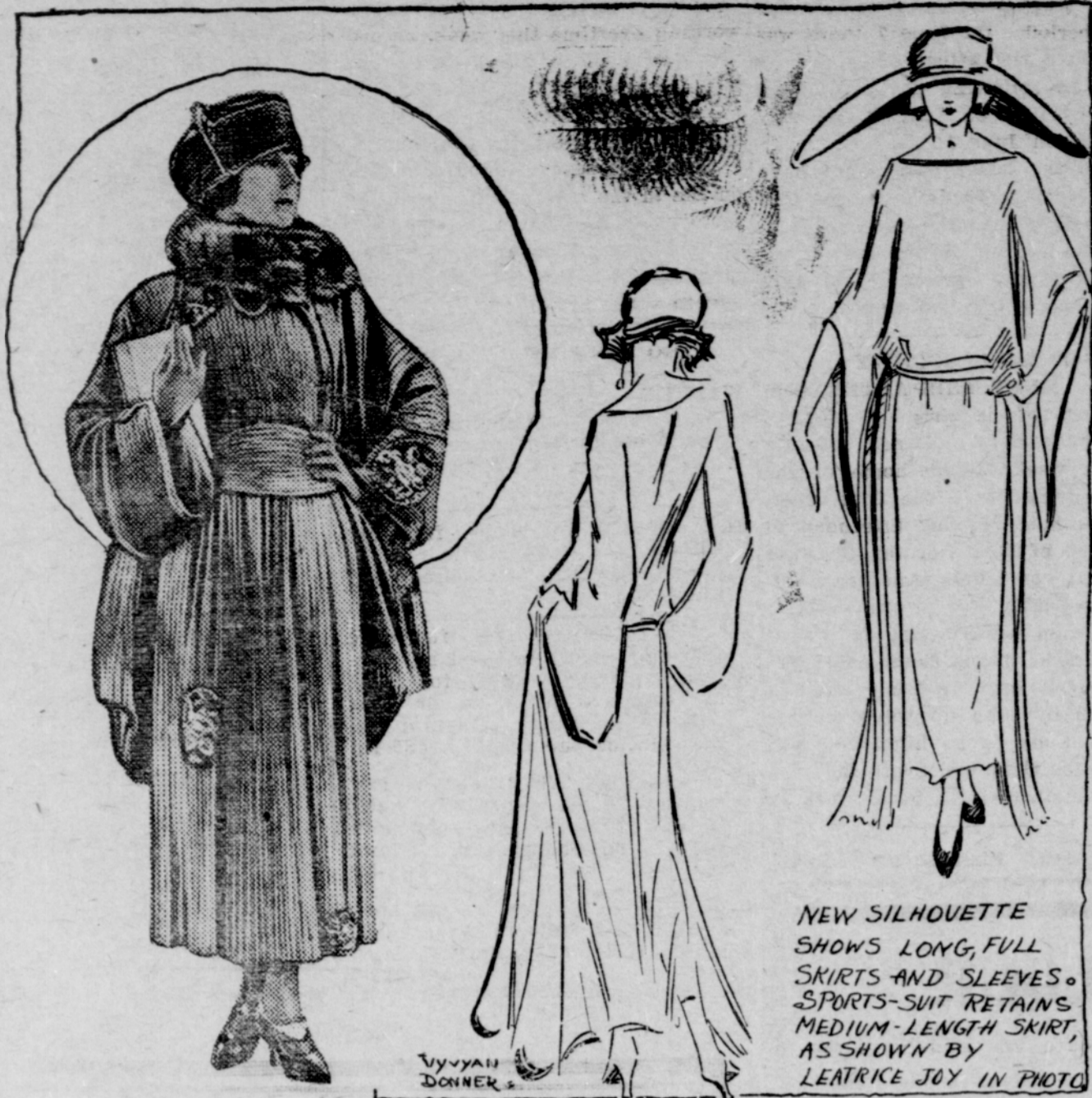
NEW SILHOUETTE SHOWS LONG, FULL SKIRTS AND SLEEVES. SPORTS-SUIT RETAINS MEDIUM-LENGTH SKIRT, AS SHOWN BY LEATRICE JOY IN PHOTO

THAT which we have so greatly feared has come upon us. We thought for the past two years that by refusing to look at it we could escape it.