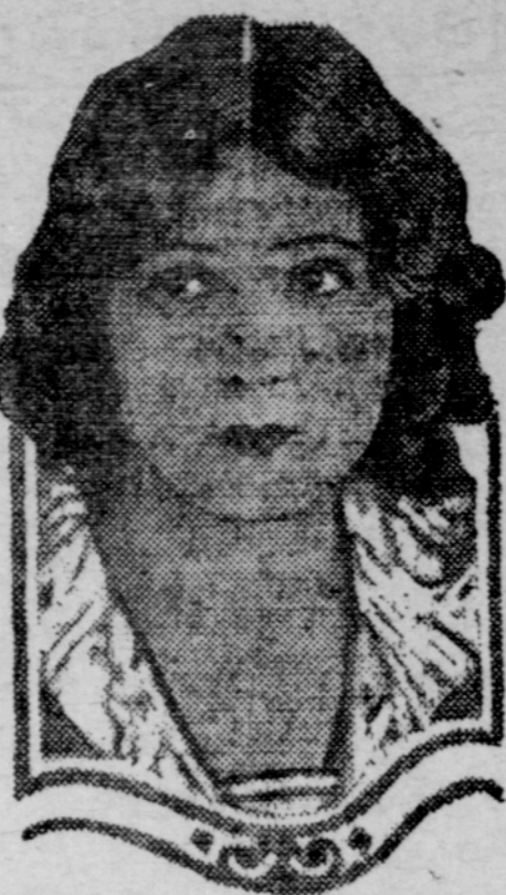
Norma Talmadge "Smilin' Through"