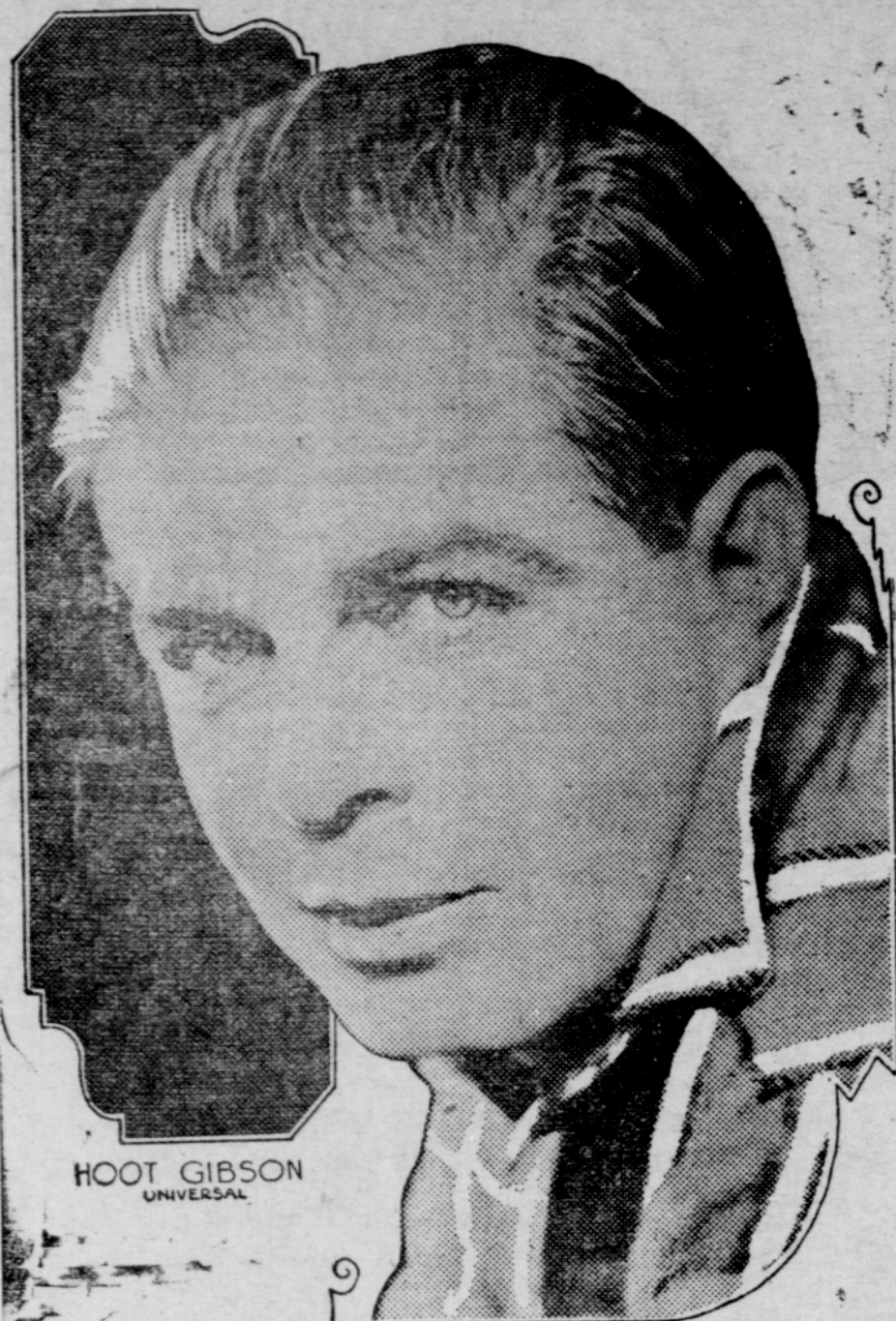
HOOT GIBSON UNIVERSAL