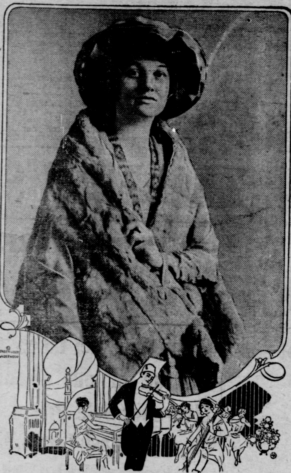
Bessie Beatty, Noted Magazine Writer and Lecturer Sees Intimate Life in Turkish Palace