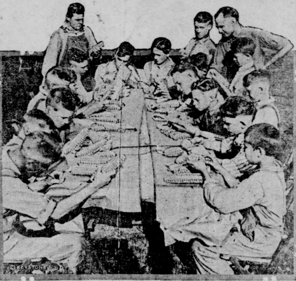
Young farmers who are learning to judge corn under the tutelage of the country demonstration agents in Tennessee. The teachers are sent out from the University of Tennessee in connection with a policy formulated by that university for the educating of the farmer.

LLOYD GEORGE WOULD GIVE GERMANY A CHANCE spite in the payment of reparations to enable her to restore her finances." Lloyd George declared in the house of commons today.