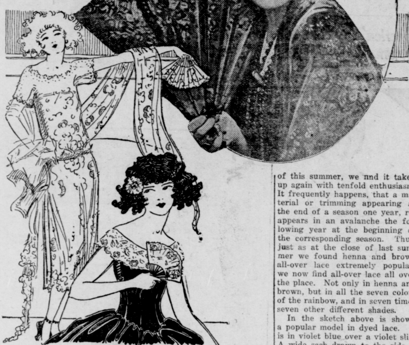
ABOVE—DYED ALLOVER LACE DRESS—BELOW—COLLAR AND FAN OF REAL LACE

EVERY article of clothing and every accessory that can be made of lace is a thing to be desired by this summer's girl. Lace dresses, lace shawls, lace scarfs, lace fans—the lace fan, gracefully large, gossamer, black,