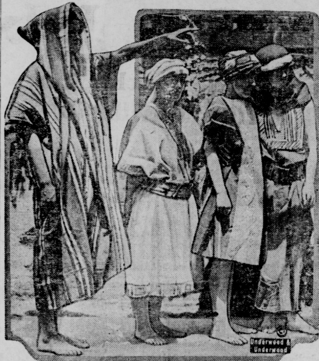
"Hagar's Flight," as portrayed in the pageant which was a feature of the convention of the National League of Girls' Clubs at Vassar. Those in the cast are veteran members of the clubs.