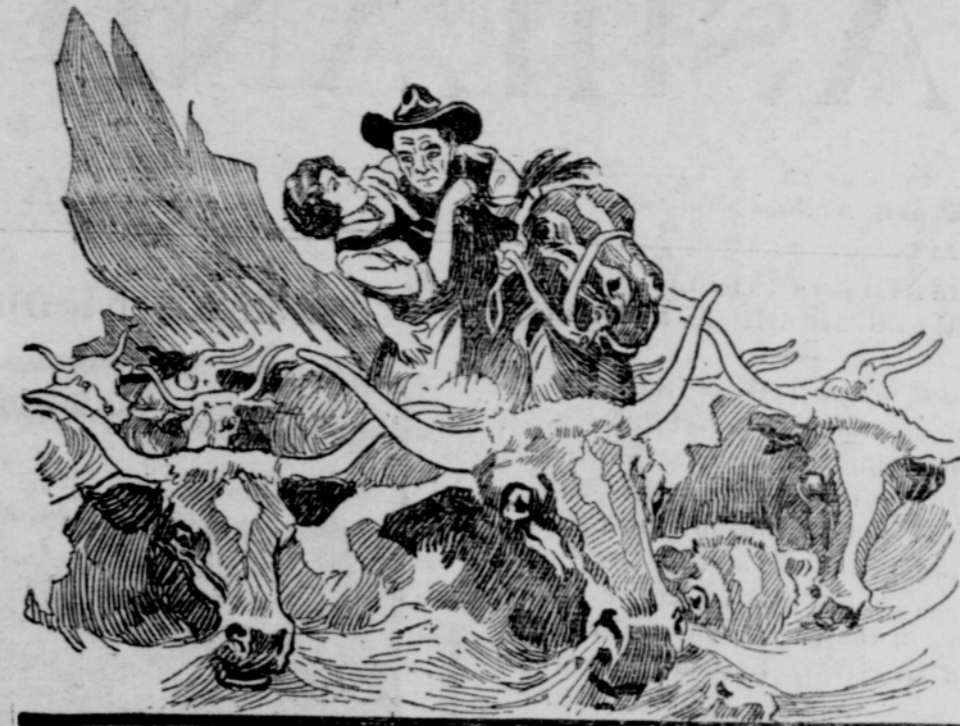
Scene from "Man-to-Man," with Harry Carey in the title role, showing a stampede of 5000 longhorns.

Get LEEDOM'S Ford Day prices on MASON CORDS. They'll knock you stiff. At Leedom's Tire Hospital. 241tf