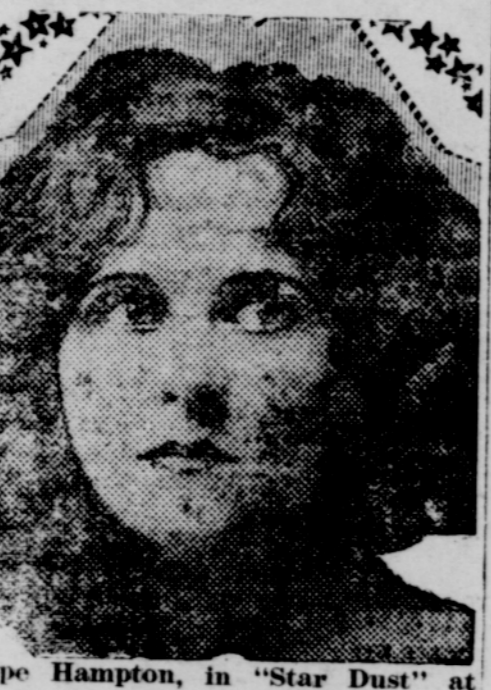
Hope Hampton, in "Star Dust" at the Vining tonight.