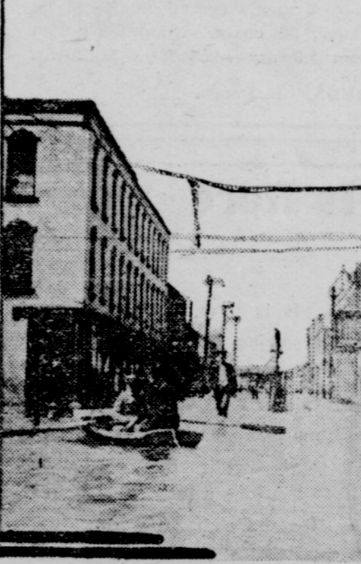
Among the towns inundated by the Mississippi river valley floods one of the worst sufferers was Beardstown, Ill., the main street of which is here shown.