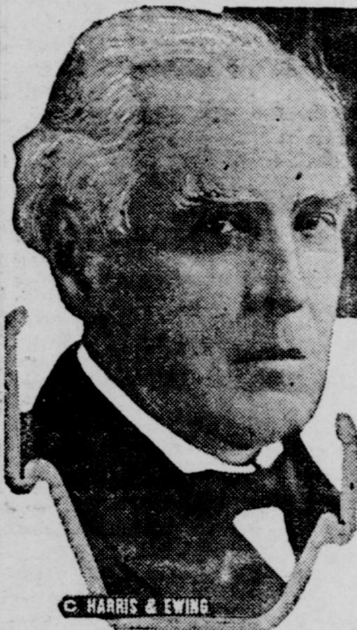
Senator C. A. Culberson of Texas, who has served 24 years in succession, is now a candidate for the fifth term. During the war he was the ranking member of the senate on the Democratic side.

Ever Meet Anyone Like Her? A man who lives in a West side boarding house describes his landlady: "She is a kind of parallelogram; that is, an oblong angular figure which cannot be described and which is equal to anything; and any two meals in her house are together less than a square meal."—New York Times.