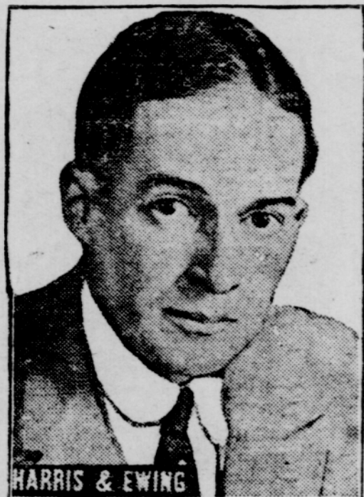
Gen. Douglas MacArthur, former commandant at West Point, who was recently ordered to the Philippines.