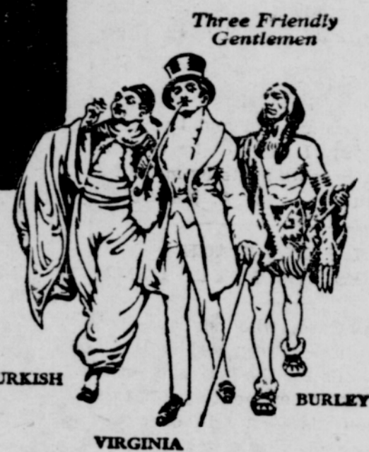
Three Friendly Gentlemen TURKISH VIRGINIA BURLEY