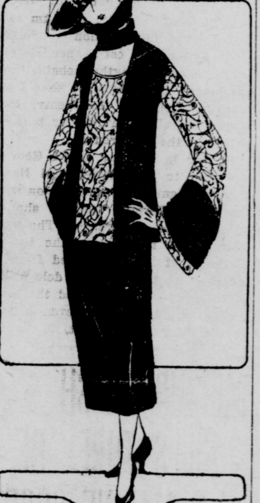
Broadcloth and Piece of Paisley Shawl Make This Interesting Street Costume.

Another stunning combination is that of a piece of paisley shawl with a dark twill, which is illustrated in one of the drawings. There are many ways in which to make use of paisley material, along with some plain material, for the dull reds and blues in