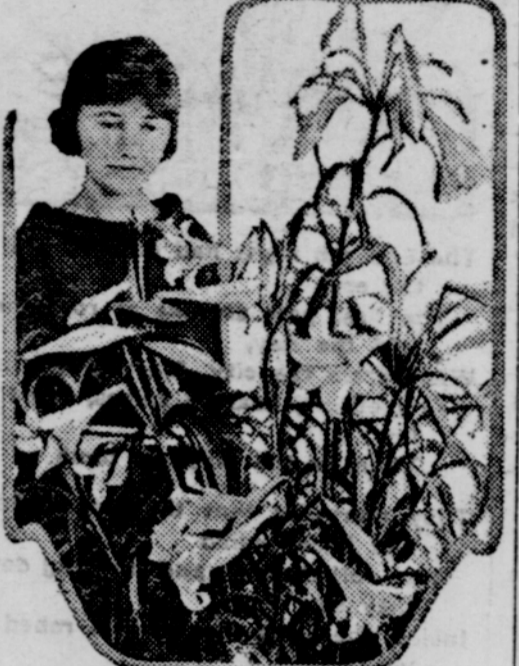
Type of Perfect Lily.

In growing Easter lilies from seeds the florist intends to handle his stocks and possibly upon which his seed becomes available, says the Bureau of Plant Industry, United States Department of Agriculture, in discussing the results of experiments with growing the flowers from seed instead of from bulbs. Sowing they say, can be done