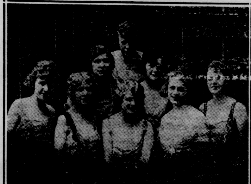
A Smart Group of Beauties with the Musical Comedy, "Irene," at the Page Theater, Medford, Tuesday, April 18.

CONVALESCENT HOME—Have you taken drugs within and treatments without and still in poor health? The Milk Diet is for you. 188-1