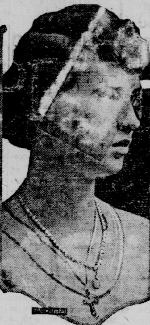
Princess Olga of Greece, who is reported engaged to Prince Christian Frederick of Denmark. The cabled announcement says the engagement took place at Cannes, France. Princess Olga is but nineteen, the prince being about four years her senior.