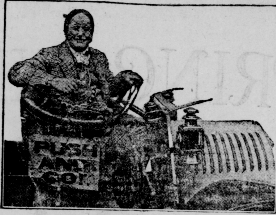
One of the Novel Scenes in The London Follies at the Page Theater, Medford, Tonight