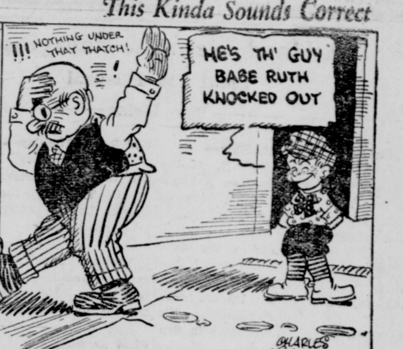
This Kinda Sounds Correct