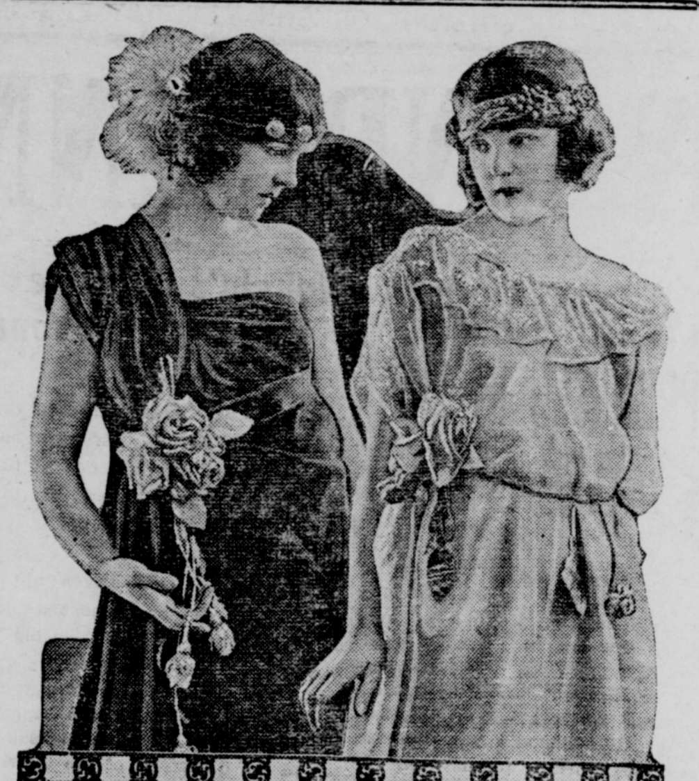
THE way of society maids and matrons this season is literally "a path of roses," for fashion decrees that evening gowns be garnished with flowers, matched with dainty flower bandeaus for the hair.

The lovely evening frocks which have at their waist trailing clusters of exquisite flowers, stems and buds. Not only the party frocks of youth, but the stately evening gowns of matrons as well, are flower bedecked. Artificial flower makers are giving much attention to the designing of flower pieces for dress adornment.