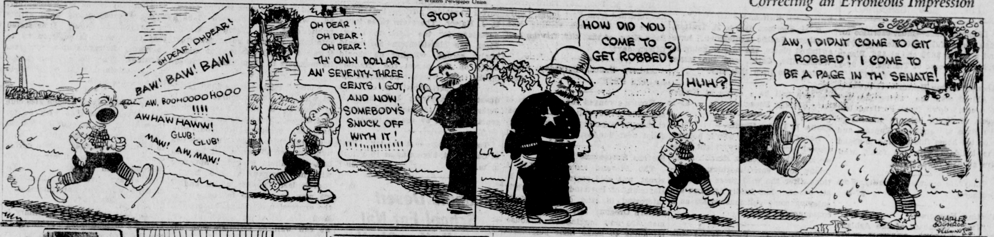
Correcting an Erroneous Impression

By Charles Sughroe © Western Newspaper Union