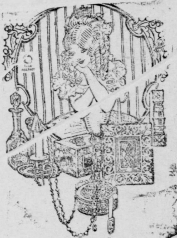
"GIFTS THAT LAST"