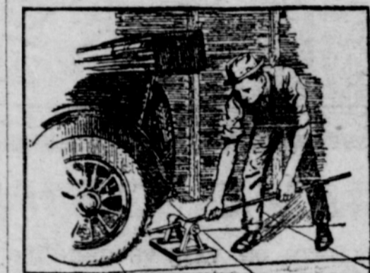
A Lifting Jack of This Description is a Great Help Around the Home

Two brackets such as are employed on the fan support are sweated to a