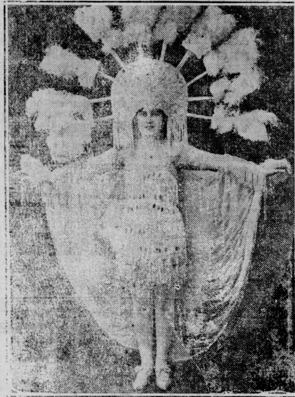
"BEE WINSOME" AT VINING TONIGHT

"The Southern Pacific is moving more freight right now than ever before in its history. There are no hard times in Oregon. The Beaver state is just coming into its own, for the fruit industry has at last assumed sufficient proportions to warrant adequate handling facilities and to attract dealers and organizations to market the crop. Recently we shipped out a solid train of fifty cars of fruit. The pessimist finds little to feed on in Oregon these days."