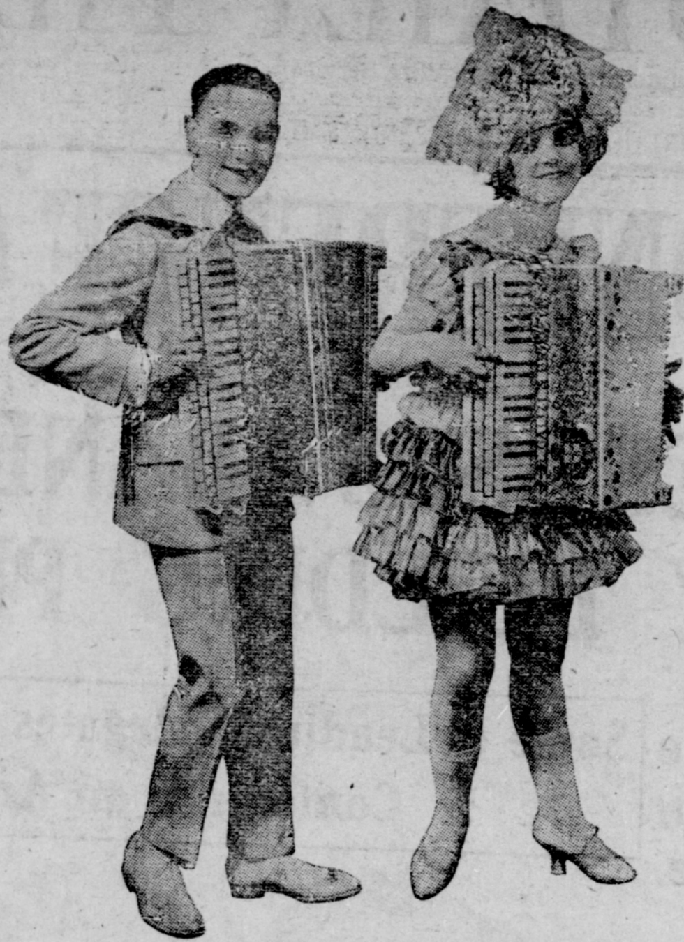
ROYAL ITALIAN ACCORDIAISTS—MARCUS SHOW OF 1921

Between these two schools of thought is Secretary of States Hughes, backed by the American delegation. He believes that the conference will move more quickly and accomplish better results by taking them up together, leaving to the naval experts the matters of navy, to the army men consideration of land armament and to the diplomats and political leaders the matters affecting China and the Pacific. The American delegation in this position has the support of the Japanese delegation, and little difficulty is expected to be encountered in reaching an agreement.