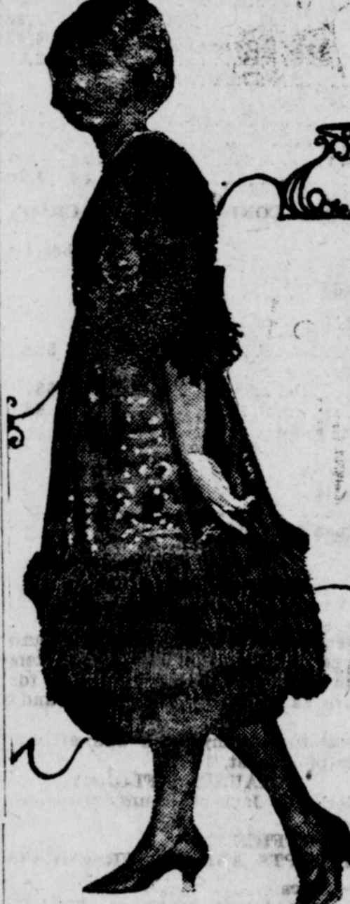
Black satin afternoon frock trimmed with monkey fur. Girdle of silver cloth heavily embroidered with black floral patterns. Slippers of black satin. Specially posed by Eva Novak, Universal star.

Europe's largest floating drydock is located at Rotterdam.