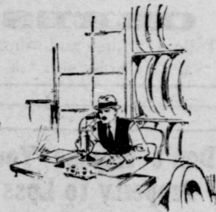
"Here is a man in close touch with one of the 92 U. S. Factory Branches"

Every way you look at it, a par quality tire at a net price.