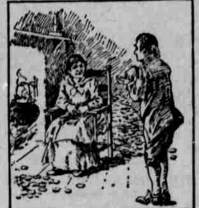
"Soon I'll Be a Rich Man, Mother," He Said.

YACO, the son of old Witch Teg, who lived on the mountain side, wanted to be rich. He did not want to live in a cave with his Witch Mother, though she did everything within the power of her magic arm to make him happy. It was not, however, in the power of Witch Teg to give gold to her son, or to any one else. Stones she could change into animals or mountains into rocks and trees, and it was whispered she had changed more than one into the shape of a wild animal. So when her son asked for gold that he might become rich and live in a