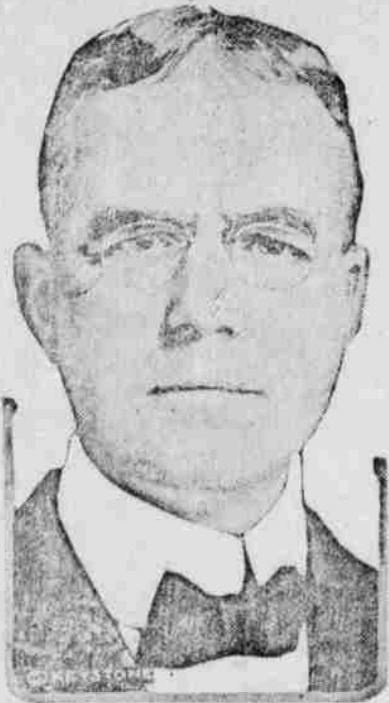
R. B. Howell, of Omaha, who is the republican candidate for United States senator from Nebraska.