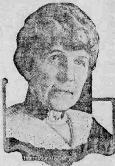
Mrs. Warren G. Harding, wife of President Harding, whose illness has aroused country-wide sympathy.