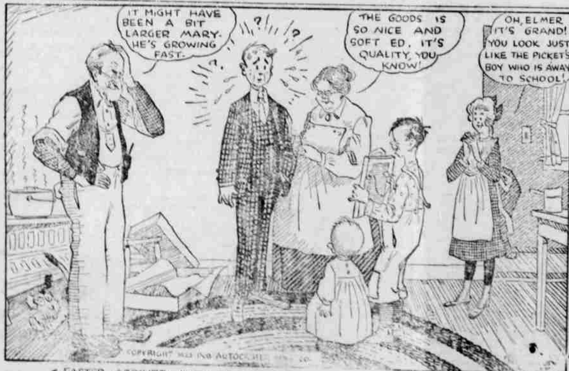
EASTER ARRIVED JUST IN TIME FOR ELMER'S FIRST LONG SUIT