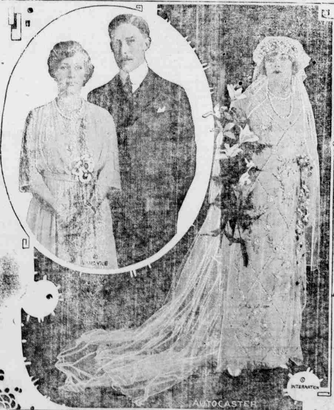
The wedding of Princess Mary to Lord Lascelles in London proved to be the biggest social event since the coronation of her father, King George, in 1911. These pictures, specially posed, are the most recent of Princess Mary and her husband. The wedding gown and veil are replicas of those worn by Princess Mary in the Westminster Abbey ceremony. They were made by Reville of London, Dressmaker to Her Majesty the Queen, imported by the Franklin Simon Company of New York, and are here exhibited by Marion Davies.