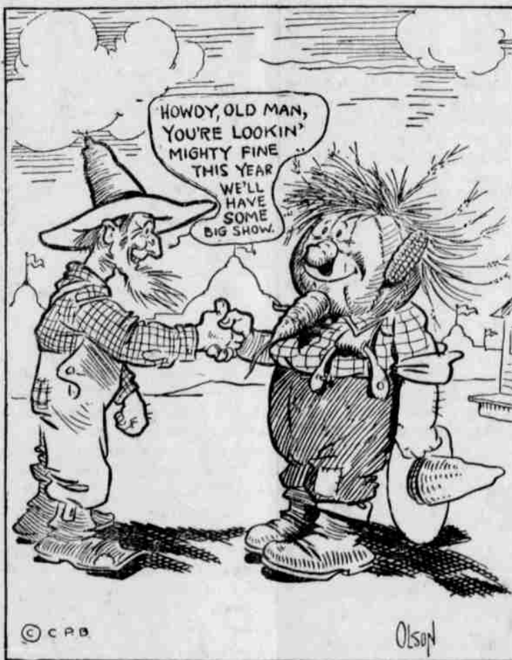
Morrow County Fair, Heppner, Ore., Sept. 15 to 17.