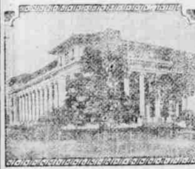
University of the Philippines which has an enrollment of 3,500 students.

"The Filipino boys and girls are well balanced, docile and industrious