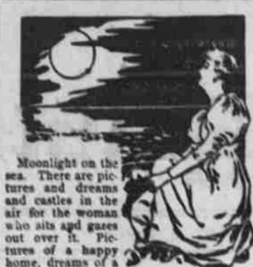
Moonlight on the sea. There are pictures and dreams and castles in the air for the woman who sits and gazes out over it.

Nothing so fully indicates the different trends of taste and preference as the variety of pets chosen by women. The latest is a turtle, and how any one can enthrall over that seems beyond belief.